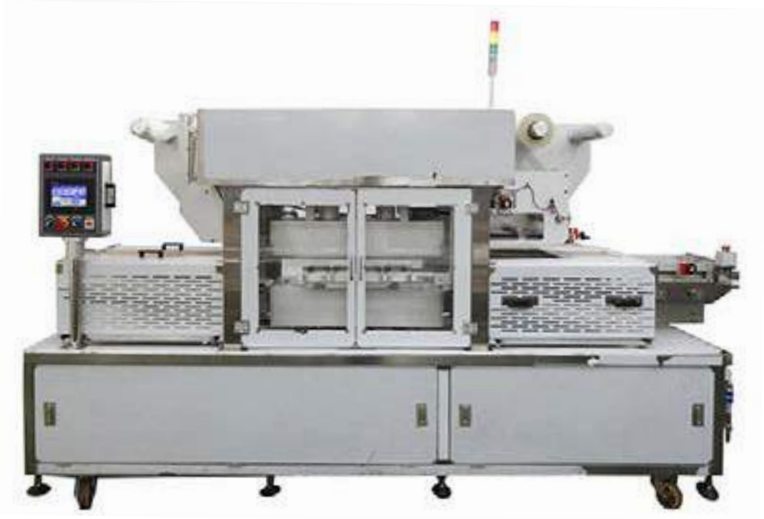
END-6 ENDURO AUTOMATIC SHUTTLE SEALER